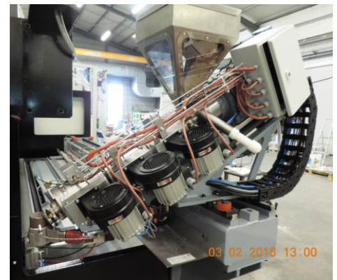
Extruder for PU granules