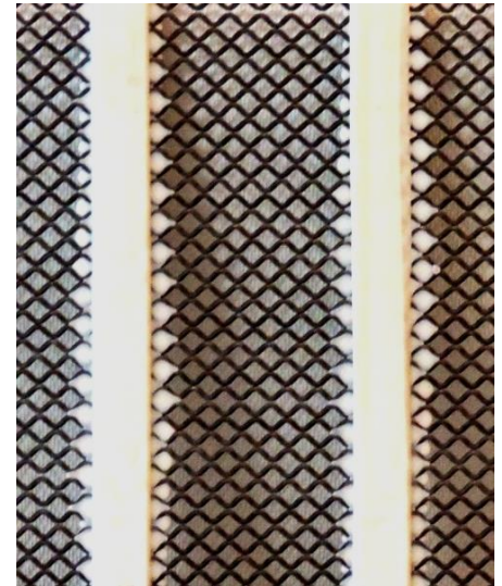
Sample with PU strips

Floor space required : W=4500 mm L=2400 mm H=2700 mm